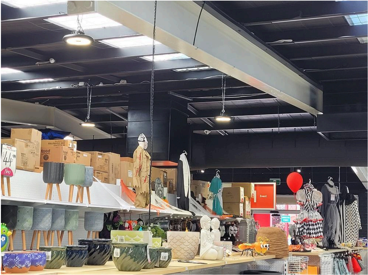
Figure 2: Illuminate Pros Installation Photo.